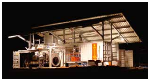
Operational 24 hours per day

With over 30 years of experience in sub-Sahara Africa and Latin America, RENTEC is Europe's leading manufacturer of professional palm oil extraction equipment. Our energy efficient mills combine the highest possible extraction rates with the lowest ecological footprint. We engineer and manufacture your equipment in our factory in Belgium, according to the highest European quality standards. You will enjoy an immediate return on your investment thanks to our unique concept of pre-assembled, factory tested mills, ready to run at arrival.