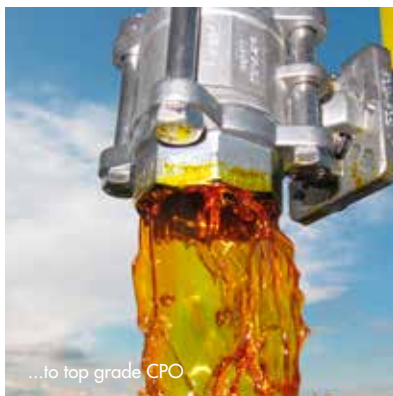
...to top grade CPO

The MODULAR is a highly efficient palm oil mill producing top grade CPO on an industrial scale. The prefabricated mill is based on a sustainable logical process, built with well-engineered and sturdy equipment.