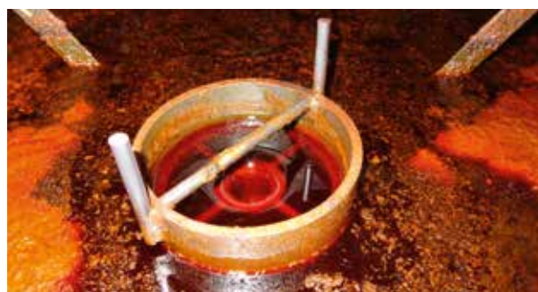
Twin-stage oil decanting